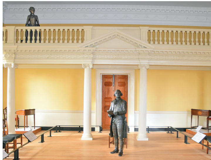
The newly restored Old Senate Chamber with bronze statues of George Washington and Molly Ridout

The rotunda is the space below the dome and is the center of the 18th century State House, built between 1772–79. The dome was added to the building between 1785–94 and is the largest wooden dome in North America. It was built entirely without nails.