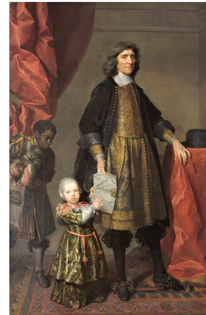
The Second Lord Baltimore Cecilus (Cecil) Calvert by Gerard Soest, c. 1665

In the lobby and on the grand staircase are 17th and 18th century full-length portraits of the Calverts. These portraits portray an entire dynasty of colonial proprietors, the Barons (or Lords) of Baltimore, and bring to life the earliest history of Maryland. The family owned the Colony of Maryland under a charter that conveyed one of the most extensive grants of powers conceded by the crown of England during America's period of colonization. Its proprietary rule ended with the American Revolution in 1776.