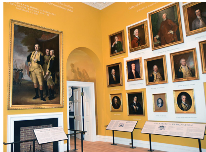
Senate Committee Room

Two very important historical portraits are featured in these three spaces: William Pitt over the fireplace in the Old Senate Chamber and Washington, Lafayette and Tilghman at Yorktown in the Committee Room. Both were painted by renowned Maryland artist Charles Willson Peale and have hung in the State House since the 18th century.