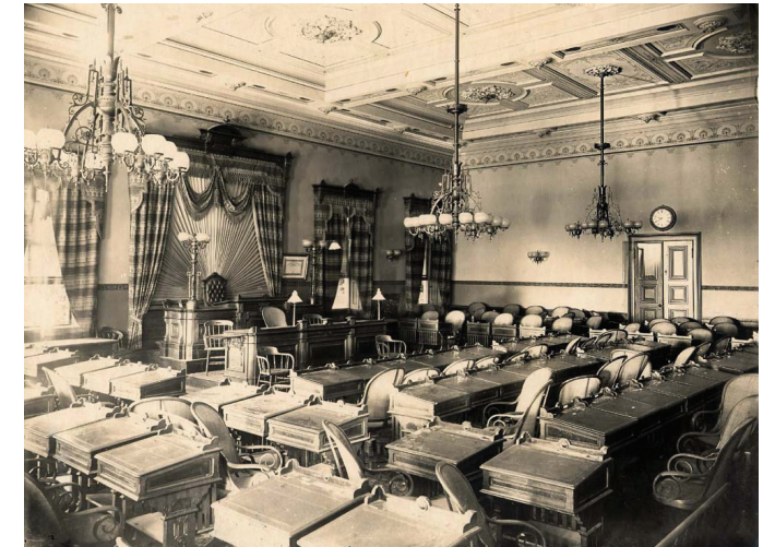
The Old House of Delegates Chamber, c. 1880

Across the hall from the Old Senate Chamber is the Old House of Delegates Chamber which has recently been recreated to how it looked in the late 19th century. The recreation of this space was guided by photographs and documents found at the Maryland State Archives.