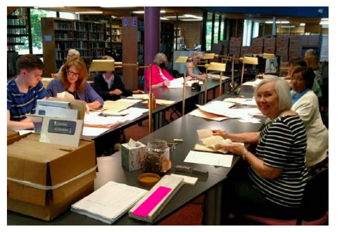
Family Search volunteers at work in the Archives Search Room, early 2020 (pre-pandemic)