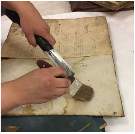
Pictured working here are the hands of Conservator, Jennifer Foltz Cruickshank.

These professionals work on site in our own conservation lab to