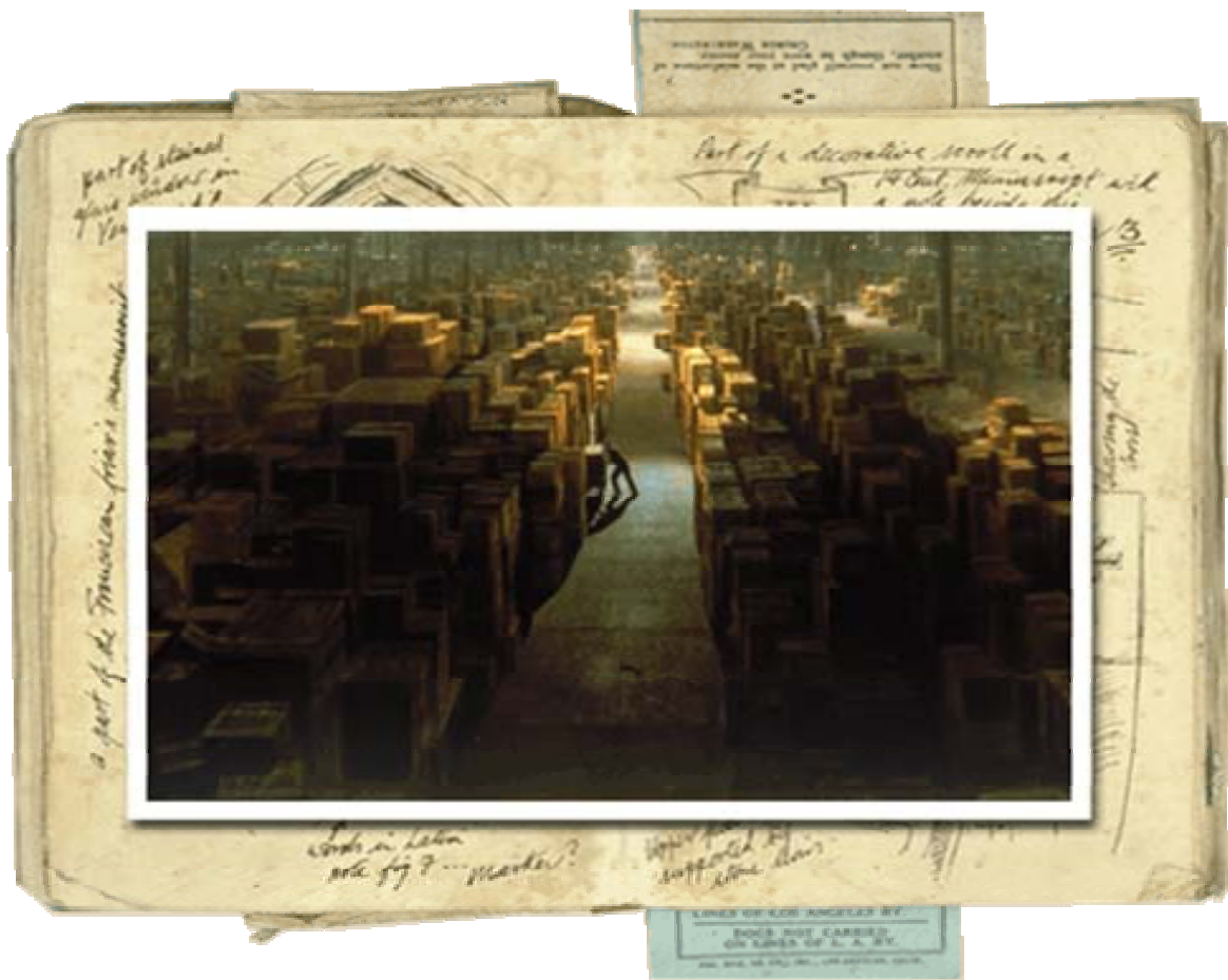
Warehouse Scene from Raiders of the Lost Ark

Permit me first to speak about the overall mission and role of the Archives. The Archives is the conscience of State government and the protector of the collective memory of our triumphs and failures as a society. On a fundamental level, the Maryland State Archives must be the repository for security copies of the records which constitute the collective memory of our world in whatever format they exist, taking care of course, not to save too much and overwhelm our capacity to evaluate and absorb the accumulated wisdom. Our role is not only to save well, but also to manage what we do save effectively. There is a final scene in Raiders of the Lost Ark (see below), which we aspire to not allowing to happen in real life. What is stored must be known and retrievable, not simply lost in a cavernous warehouse somewhere.