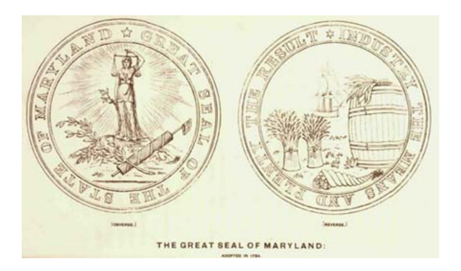
1794 Seal of Maryland

Not until 1794 did the state finally adopt a new seal, which was designed by famed artist, and Marylander, Charles Willson Peale. It was full of republican imagery befitting the newly established United States. The obverse showed an image of Justice, while the reverse had sheaves of wheat, a sailing ship, tobacco leaves atop a hogshead (barrel), and a cornucopia, representing Maryland agriculture and trade. Around the outside ran the motto "Industry the Means and Plenty the Result."