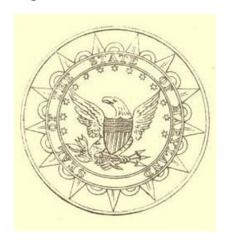
1817 Seal of Maryland

That seal remained in use until 1817. One author has speculated the seal was changed because the 1794 one was quite large, and designed for making wax impressions, not for embossing paper, and was thus inconvenient to use. The 1817 seal showed a fairly generic Federal-style eagle. It was used until the seal press began to wear out.