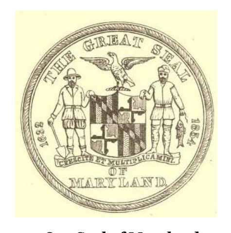
1854 Seal of Maryland

In the 1850s, when the government contemplated purchasing a new seal die, it decided to return to the state's colonial past. Governor Enoch Lewis Lowe called for the new seal "to consist of the arms of