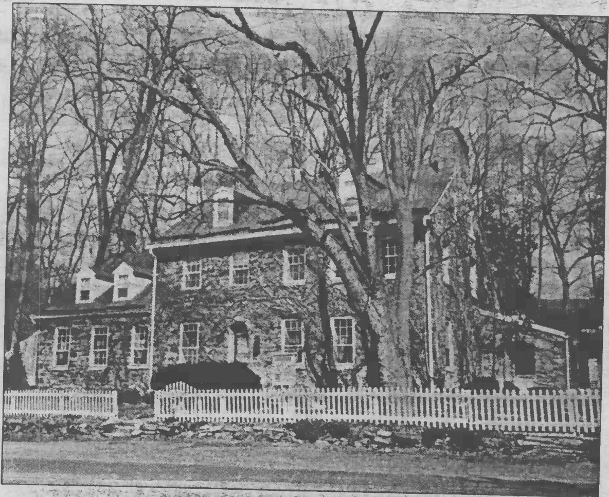
The 30-year-old Milton Inn in Sparks is set for a grand reopening in September.

First-story windows in both wings and main block are 9-over-6 panes in layout. The second-story windows in the main block are 6-over-6 double-hung sash types. With sheds and wings, the building footprint is somewhat irregular, as shown on the property plat.