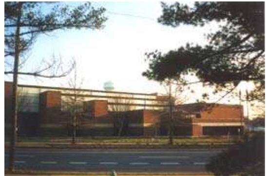
State Archives (now the Edward C. Papenfuse State Archives Building), 350 Rowe Blvd., Annapolis, Maryland, March 2004.

Origins of the State Archives trace to the State's tercentenary celebrations in 1934. As the 300th anniversary of Maryland's founding approached, the Maryland Tercentenary Commission made a modern, centralized archives a key feature of the State commemoration. A "Memorial Hall of Records" was proposed as early as 1928, and in 1931 the General Assembly appropriated funds to erect an archives building in Annapolis. Construction began in 1934, and the first Hall of Records, located one block north of the State House, opened to the public in 1935. There, the records remained until 1986 when the State Archives moved to the new Hall of Records Building on Rowe Boulevard across from the Robert C. Murphy Courts of Appeal Building. On June 27, 2005, the Hall of Records was rededicated as the Edward C. Papenfuse State Archives Building.