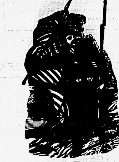
WAR AGAINST HIGH PRICES.