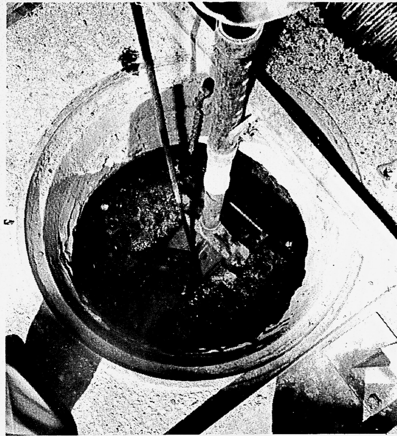
Pipe-like structure protruding from man-hole at right takes strain off cable as sewer-cleaning bucket is pulled back and forth.