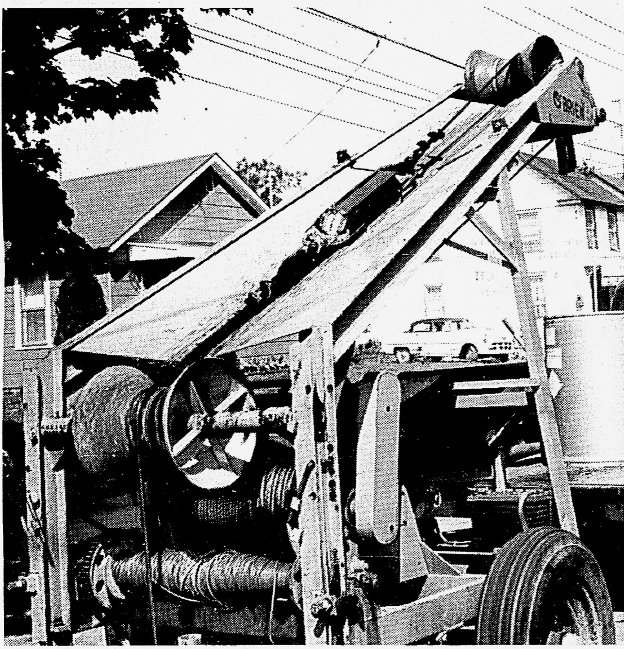
Sewer-cleaning bucket travels up incline and automatically dumps contents in barrels on truck.