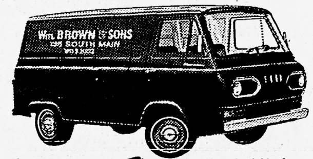
*Econoline Van; loadable from 2 sides and rear! New 170-cu. in. Six! F.O.B. Detroit. Mfrs. suggested retail price