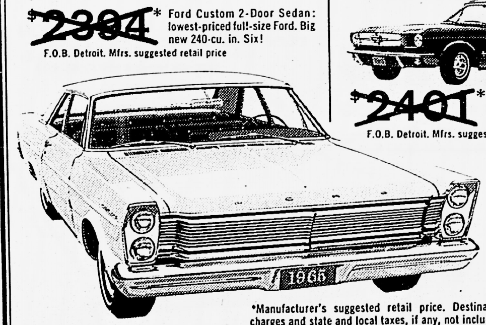
*Manufacturer's suggested retail price. Destination charges and state and local taxes, if any, not included. Options such as white sidewall tires are extra cost.

WHILE THEY LAST! GREAT SELECTION! IMMEDIATE DELIVERY!