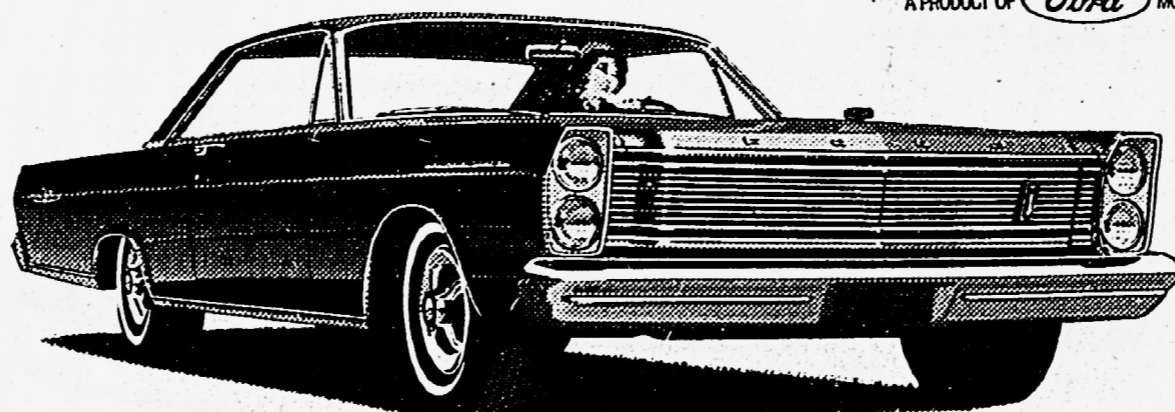
1965 Ford Galaxie 500/XL 2-Door Hardtop

WALT DISNEY'S MAGIC SKYWAY AT THE FORD MOTOR COMPANY PAVILION, NEW YORK WORLD'S FAIR