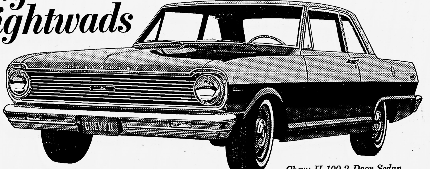
Chevy II 100 2-Door Sedan

Chevy II With aluminized exhausts that discourage corrosion... Delcotron generators that encourage longer battery life... brakes that adjust themselves... rocker panels that flush themselves free of dirt and salt. Tight? They're downright miserly! You're looking at the lowest priced sedan and station wagon that Chevrolet makes. They're good looking. Clean. Functional. You can get an economical 4-cylinder engine in the sedan or in both cars, a 120-hp Hi-Trim. Six that's quick to do everything but cost you money. As we said earlier, these are our lowest priced cars. Try one out today. Drive something really new—discover the difference at your Chevrolet dealer's Chevrolet • Chevelle • Chevy II • Corvair • Corvette