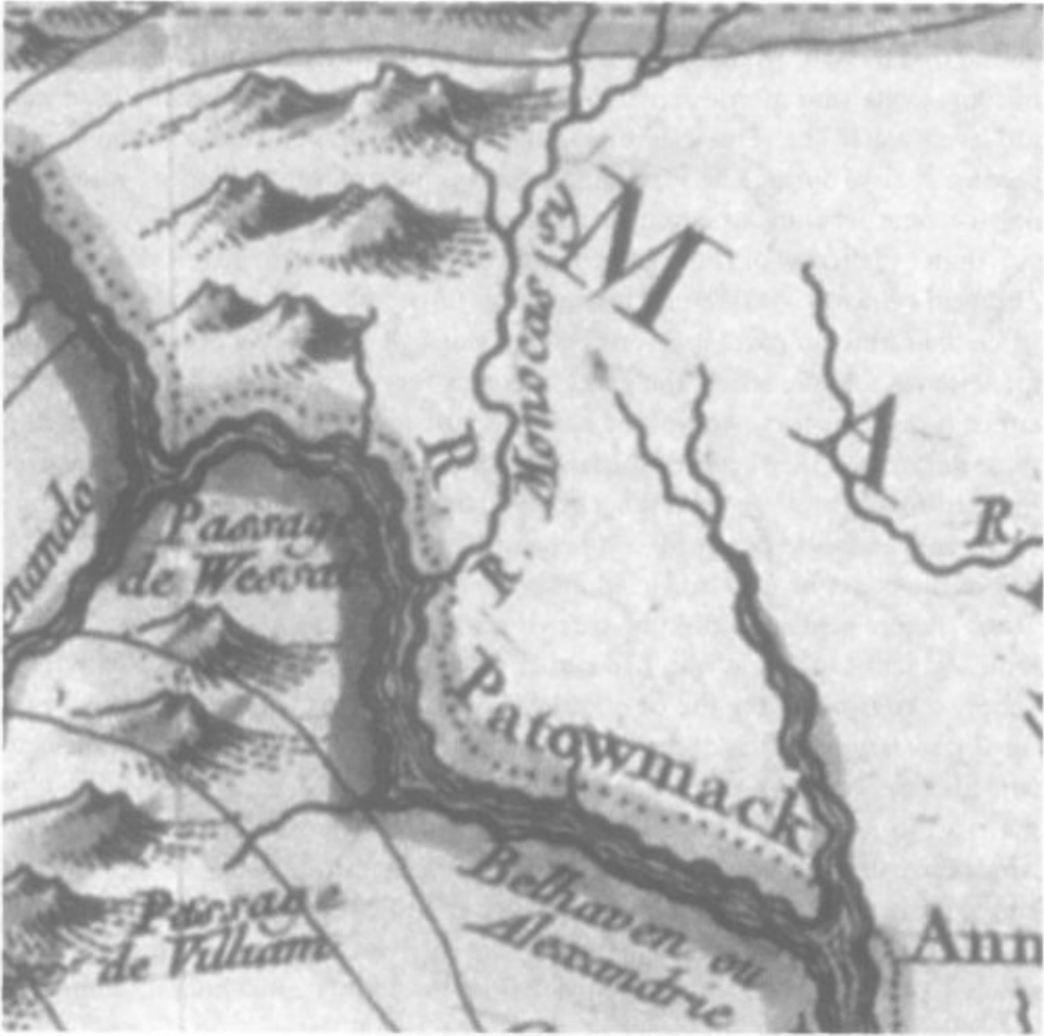
Detail, Bellin, Carte de la Baye de Chesapeak . Pearle settled near the Monocacy River, on Carrollton Manor.

nity added yet another dimension to the complex web of relationships defining and protecting their place in society.