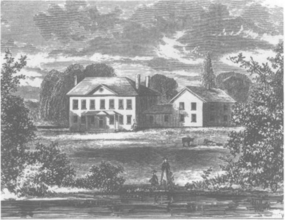
Tilghman's Hermitage, Tilghman family home on the banks of the Chester River.