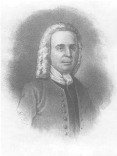
Matthew Tilghman (1718–1790). Tilghman's work at the First and Second Continental Congresses earned him the nickname "Father of the Revolution" in Maryland.

tion and of the strictest virtue And utterly averse from all violent Measures," stayed with his brother during the session. Since the delegates had agreed to keep their deliberations secret, Matthew could give his sibling only a general sense of how the proceedings progressed. James inferred there were two parties within Congress, one willing to adopt a more extreme stance towards Parliament than the other. He could not gather which of the two would prevail. 17