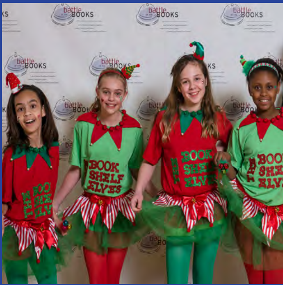
BATTLE OF THE BOOKS