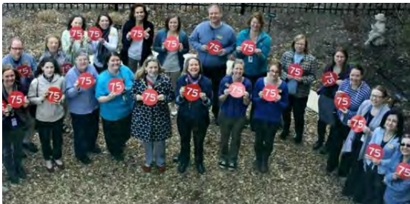
MILLER BRANCH STAFF

An award-winning educational institution that ranks among the finest in the nation, Howard County Library System's (HCLS) roots date back to 1940. Visionary leaders and an incredibly supportive Howard County community have guided HCLS over the decades. These architects diligently focused on making first-rate education available to all, regardless of age, background, or means.