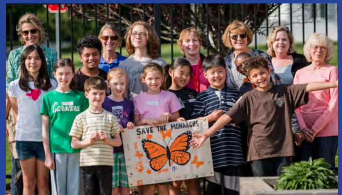
ENCHANTED GARDEN – MONARCH BUTTERFLY CLASS