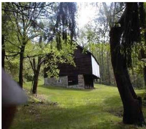
Evergreen Barn Project, Photo Courtesy of Evergreen Heritage Center Foundation

Program Funds: MAERDAF funding has trained a cohort of 15 Community Health Workers (CHWs) to meet demands of current health care deficit on the Eastern Shore. Assistance in job placement was provided for all trained CHWs upon training completion.