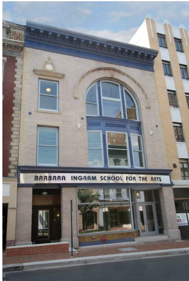
Barbara Ingram School for the Arts Washington County Public Schools Hagerstown, Maryland