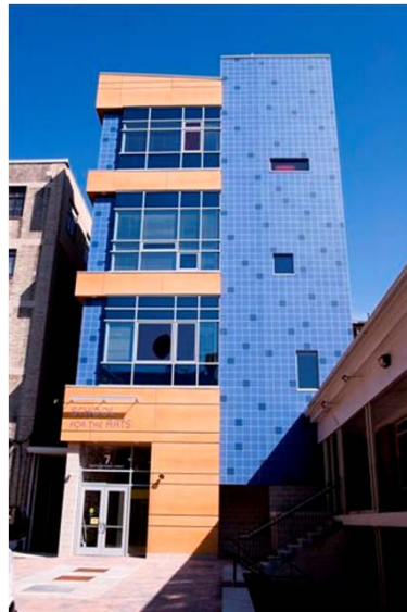
Barbara Ingram School for the Arts, Rear Facade Hagerstown, MD