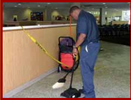
WTC Environmental Services student preps the floors in the State Center Café

Students in WTC's Environmental Services program put their new floor care skills to the test in a real world setting as they removed a five-year accumulation of old wax and polish from the State Center Café in the State Office Building in Baltimore. This on-the-job experience came about because of a new partnership between DORS, the State of Maryland's Department of General Services and the Maryland Business Enterprise Program for the Blind (MBEPB), which manages the café.