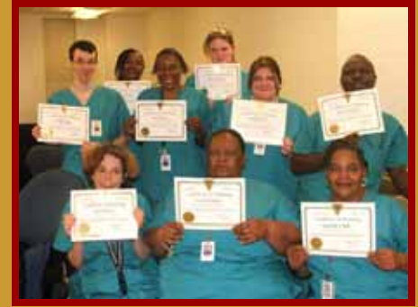
Proud graduates of WTC's first Personal Care Aide class

Nine students celebrated completion of the first Personal Care Aide training program at DORS Workforce & Technology Center (WTC) in 2007. The result of a unique partnership between DORS and ActionTemp Services, these students felt confident and ready to begin their new careers assisting elderly, ill or disabled individuals in adult day care centers, nursing homes and other facilities.