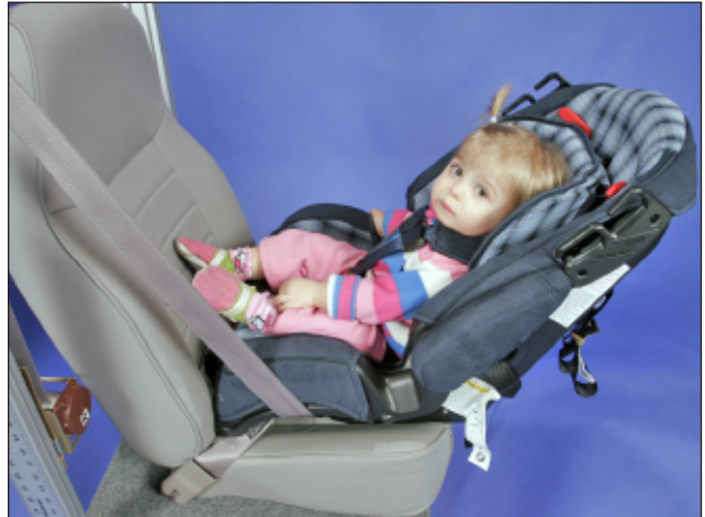
Rear-facing convertible car seat: allow toddlers to rear face up to 35 pounds (weight limits differ by brand).

In fact, the American Academy of Pediatrics (AAP) recommends that infants should ride rear-facing to the maximum weight or height of the rear-facing convertible (or toddler) seat because it provides the best protection. Rear-facing provides better protection than forward-facing because infants and young children have weak neck and shoulder muscles and soft, immature bones. Car seats, especially in the rear-facing position, safeguard these fragile parts and provide maximum protection during a collision. When positioned rear-facing, the back of the car seat absorbs much of the energy of the crash, cradling the child's head and neck. This helps prevent brain and spinal cord injuries. Most convertible car seat manufacturers recognize the value of rear-facing, so car