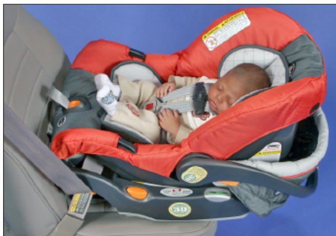
Rear-facing infant seat: for newborns and young babies (weight limits, from 22-30 pounds, differ by brand).