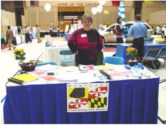
A Women's Fair

state agencies to spread the word about the Maryland Commission for Women's resources and events.