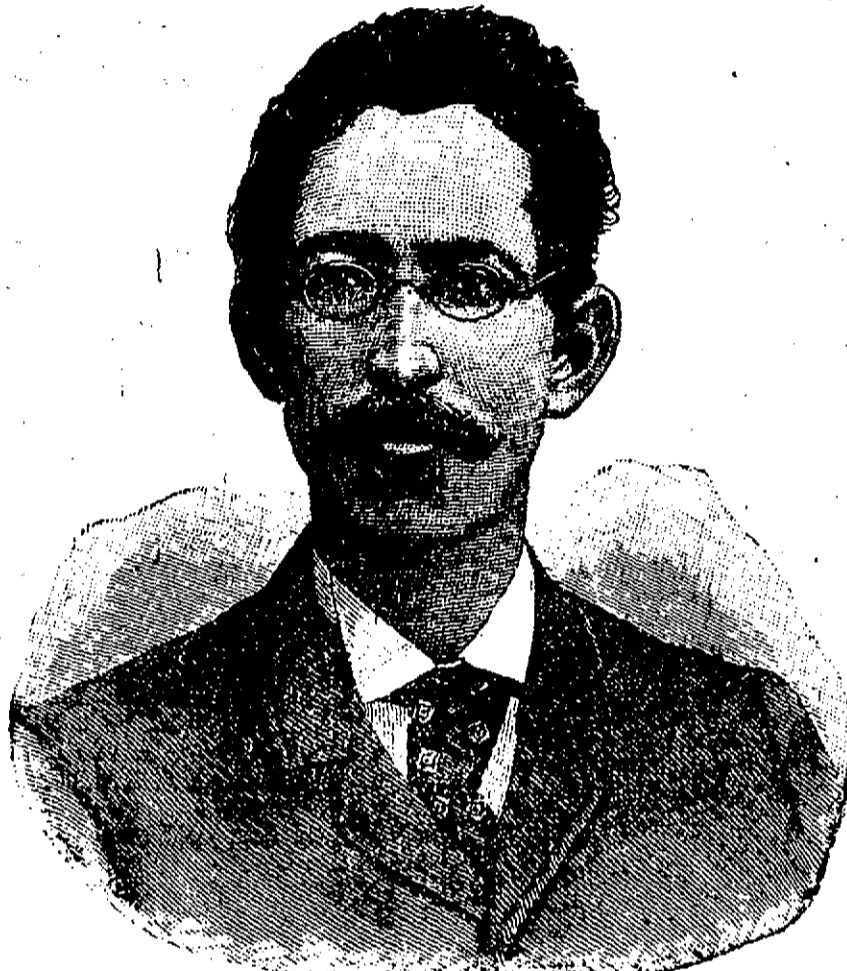
T. T. FORTUNE, Editor of The New York Age, The Nestor of Afro-American Journalism