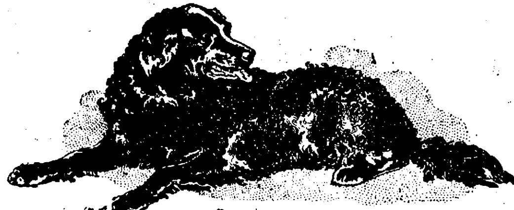
MAJOR, the $2000.00 dog.

CALL OR WRITE, INCLOSING 2 CENT STAMP FOR REPLY.