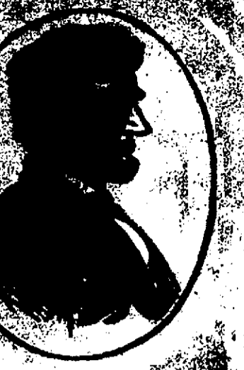
FOR GOVERNOR Hon. Lloyd Lowndes

The Republican Nominating Convention was fortunate in being able to meet its duty in the solution of the very difficult problem it had before it that of avoiding a factional nomination and making one calculated at once to unite all elements of the party.