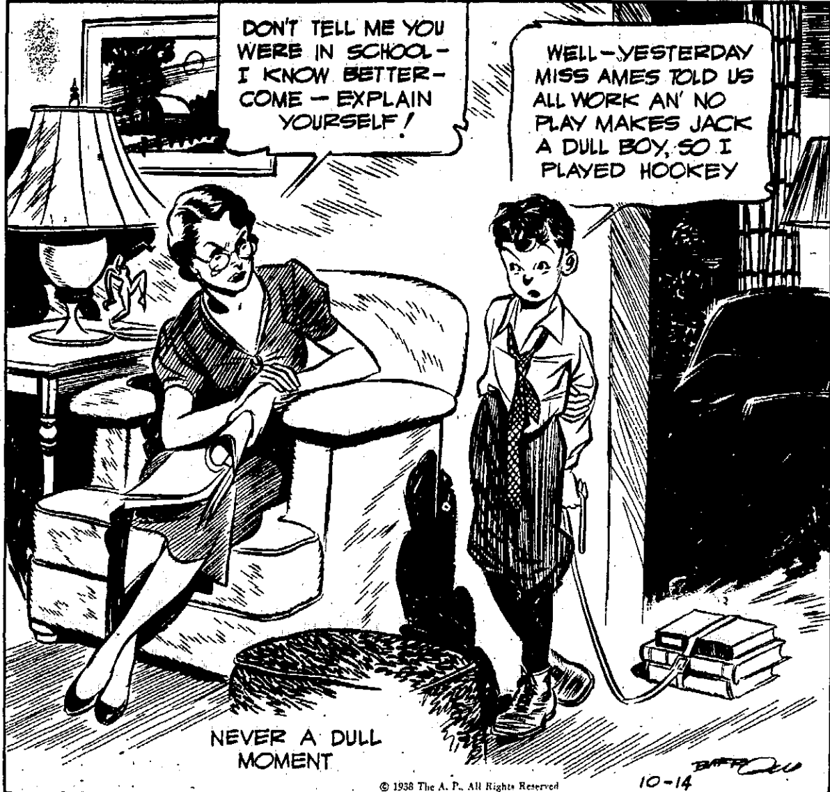
NEVER A DULL MOMENT