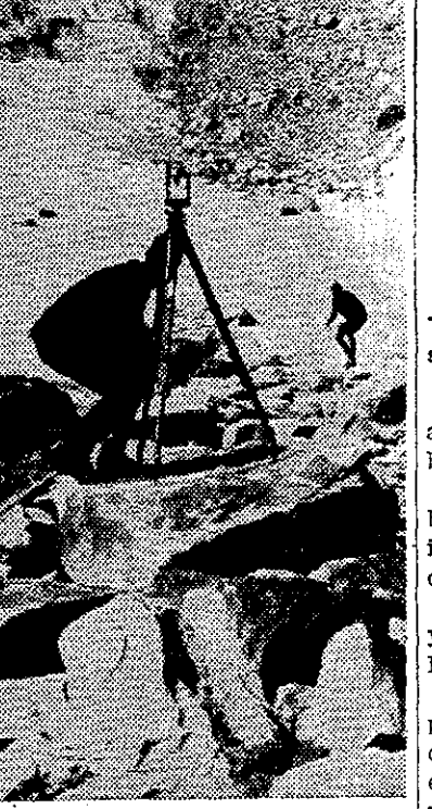
Rangers are measuring the distance from a spot marked X near Tyndall, to the nearest glacial ice.

If other glaciers in the United States have grown as much as these, Earl A. Trager, chief of the national park, naturalist division, believes it will be a definite indication that the United States is entering a wet cycle. The two are Tyndall and Andrews, mile-long bodies of ice that snuggle up against the Continental divide in Rocky Mountain national park.