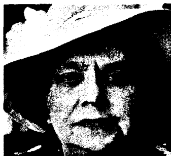
JUANITA JACKSON MITCHELL

Juanita Jackson Mitchell attended law school to help her mother, who was president of the Baltimore branch of the NAACP. A 1950 graduate of the University of Maryland Law School, Mitchell served as counsel in suits that eliminated