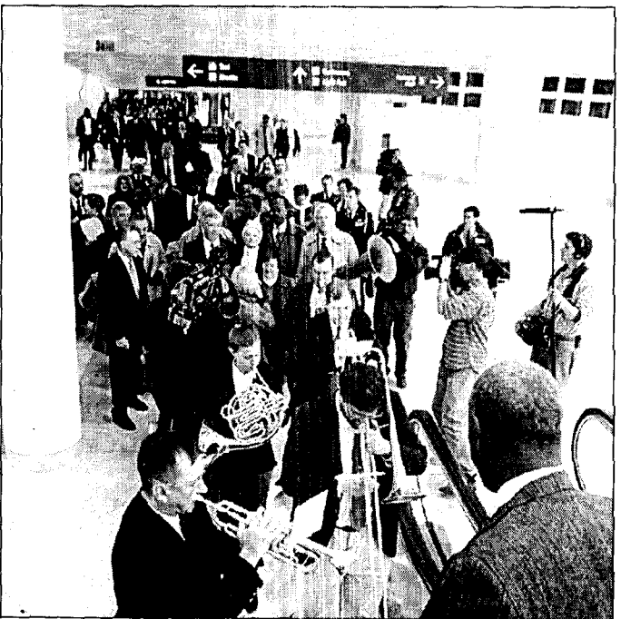
Rousing dedication: A brass band leads the way to the main floor of the new terminal for light rail at BWI.