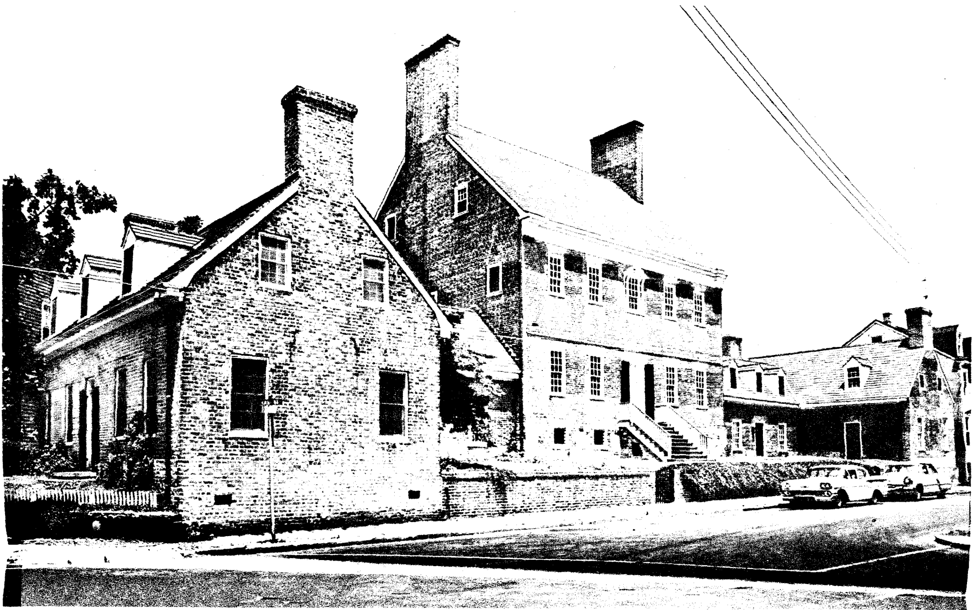
Brice House in historic Annapolis exhibits the "five-part" plan, where the main house is flanked with wings and passages.