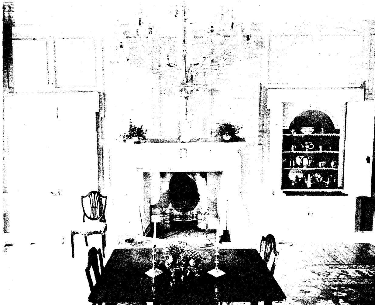
A Waterford glass chandelier lends beauty to the paneled dining room. Period furniture fits the pattern, but the coal-burning grate in the fireplace was considered rare at the time.