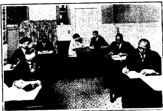
BRANCH OFFICE OF VICTORY LIFE INSURANCE COMPANY 1118 DRUID HILL AVENUE

The above is where our agents are trained in the profession of Life Underwriting. We teach the "Case Method", which embraces the science of analyzing Life Situations. We do not "sell policies" but instead prescribe protection to fit the needs of the individual. Our service in this connection is FREE.