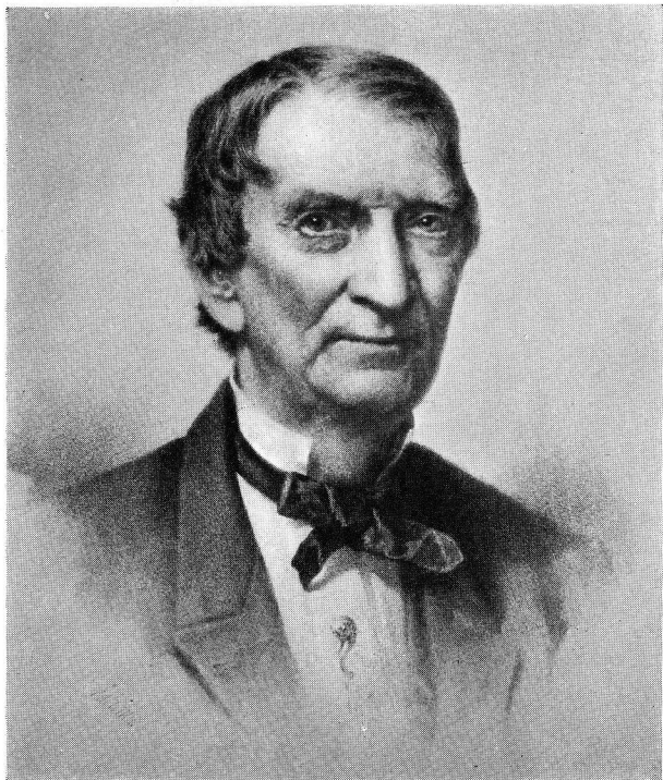
EZEKIEL F. CHAMBERS (In 1864)