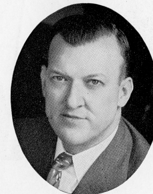
Theodore R. McKeldin Governor of Maryland