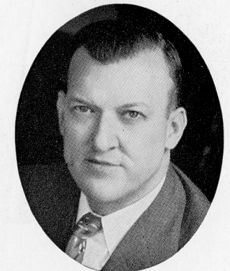
Theodore R. McKeldin Governor of Maryland