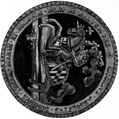
O B V E R S E