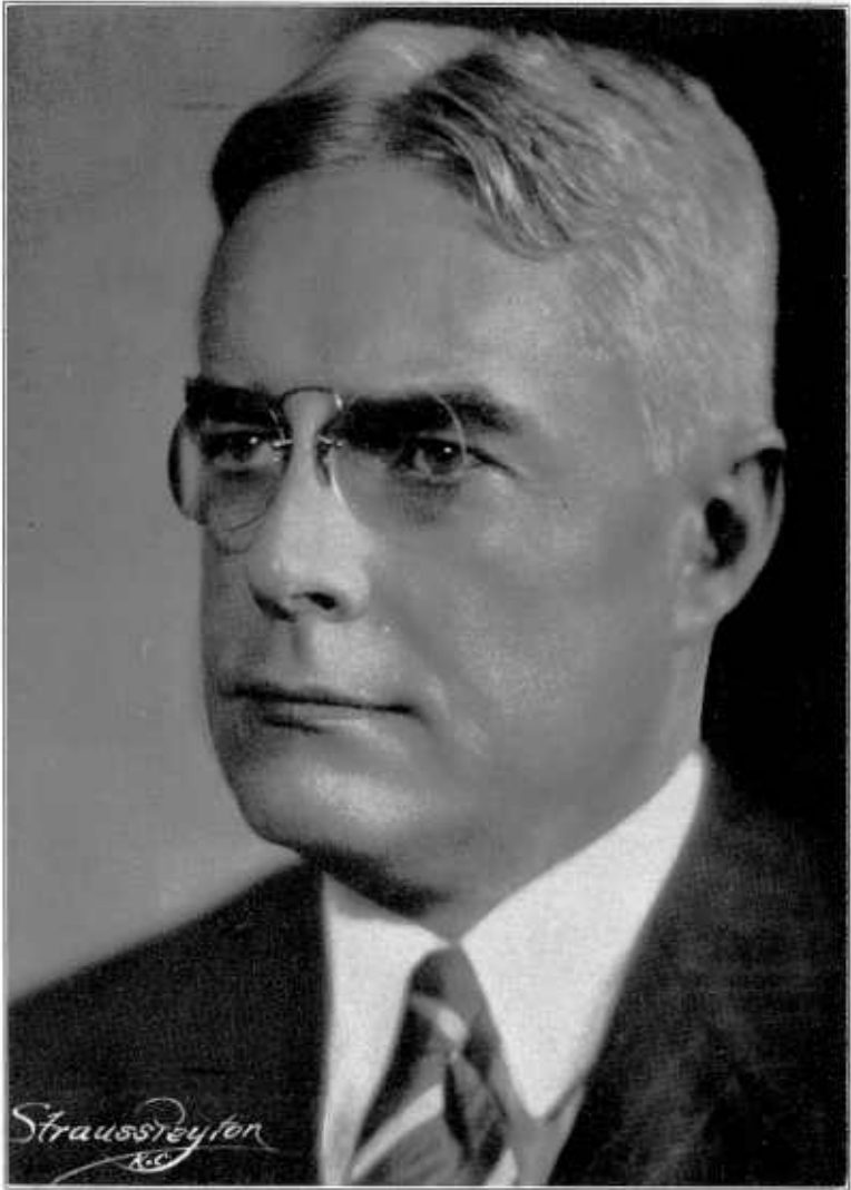
HON. ALBERT C. RITCHIE Governor