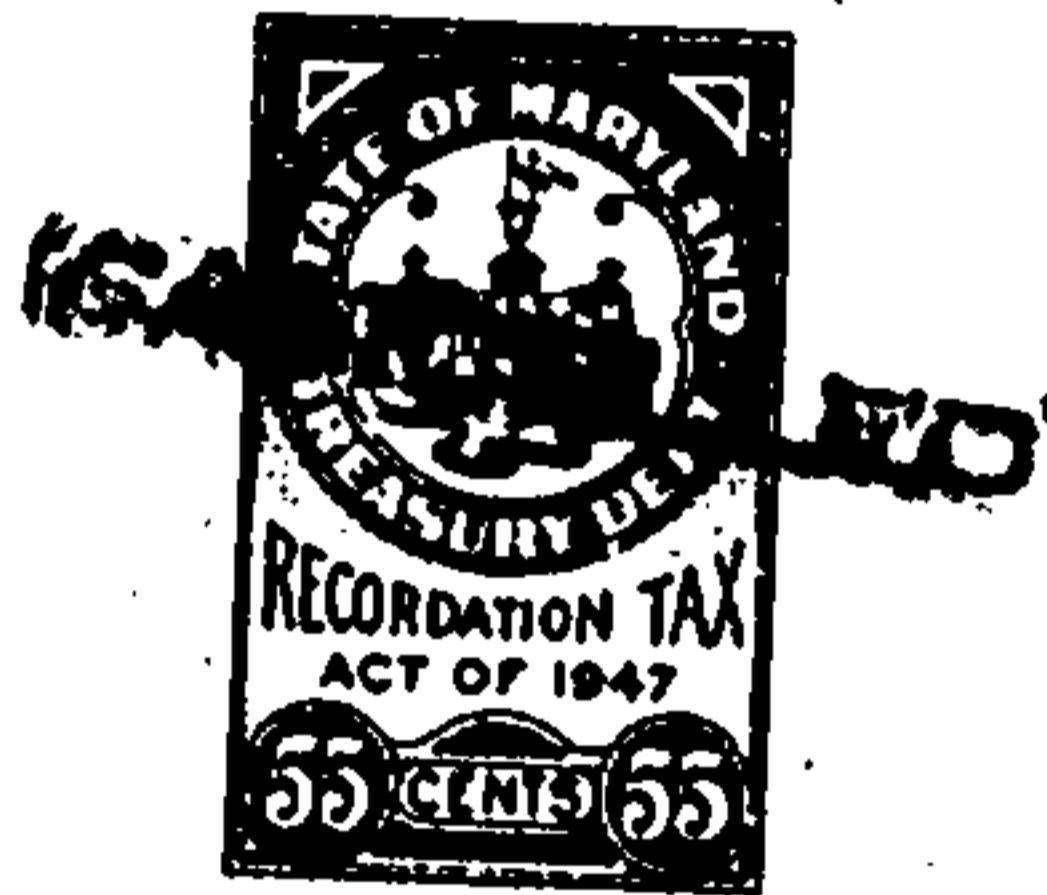
Exhibit 2 Filed July 19, 1965