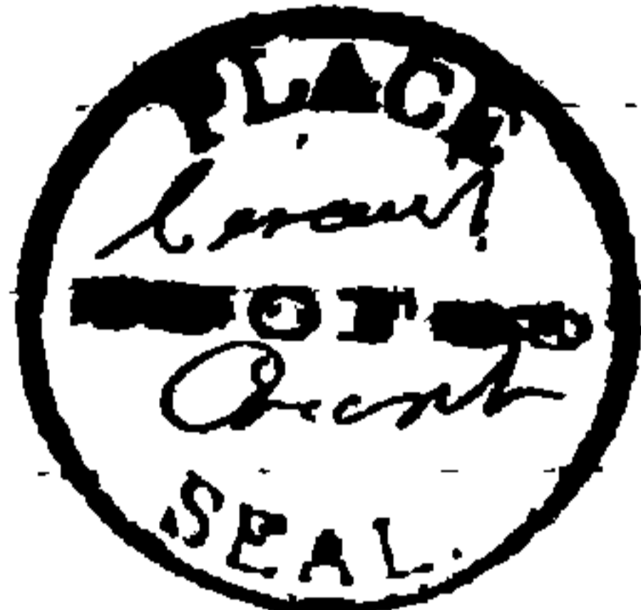
Exhibit No. 3.

Clerk of the Circuit Court for Frederick County, Md.