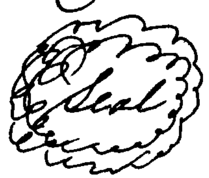
Exhibit No 2