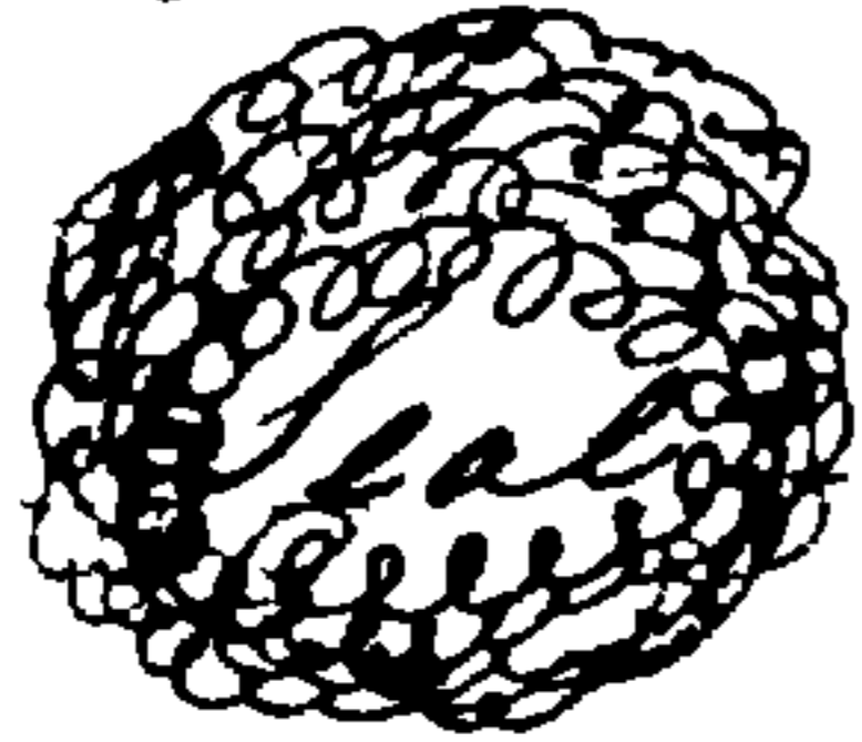
Exhibit No. 9

In testimony whereof I herewith subscribe my name and affix the seal of the Circuit Court for Frederick County this 14 th day of December A. D. 1863 ~