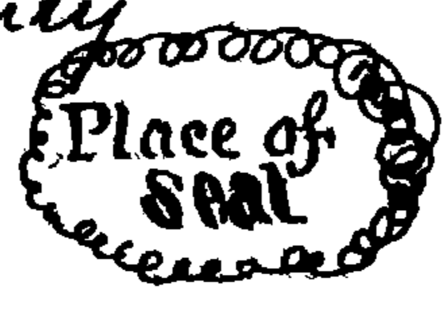
Exhibit No 2 to Petition