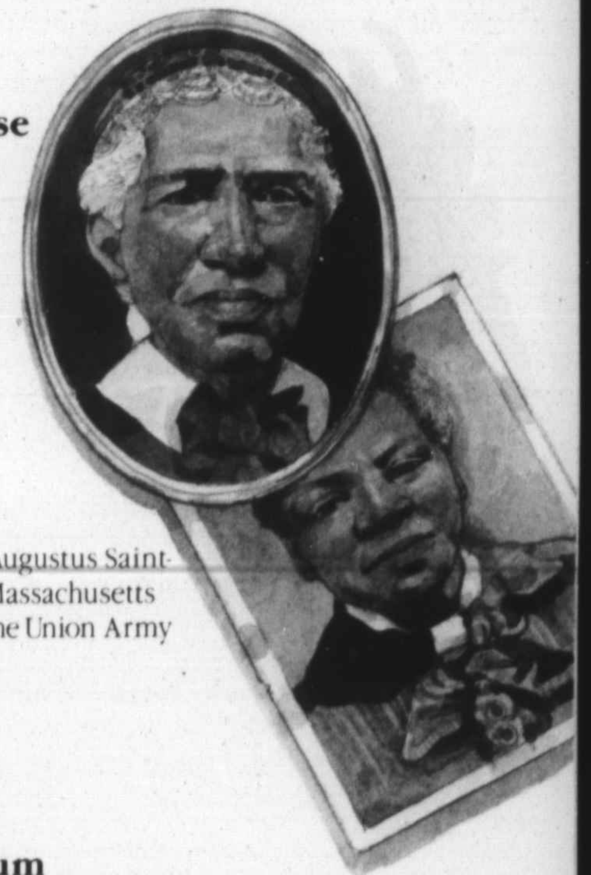
Aunt Clara Brown, Early Western Settler Mrs. Biddy Mason, Philanthropist Great Plains Black Museum

2213 Lake Street, Omaha, NE 68110, (402) 345-2212