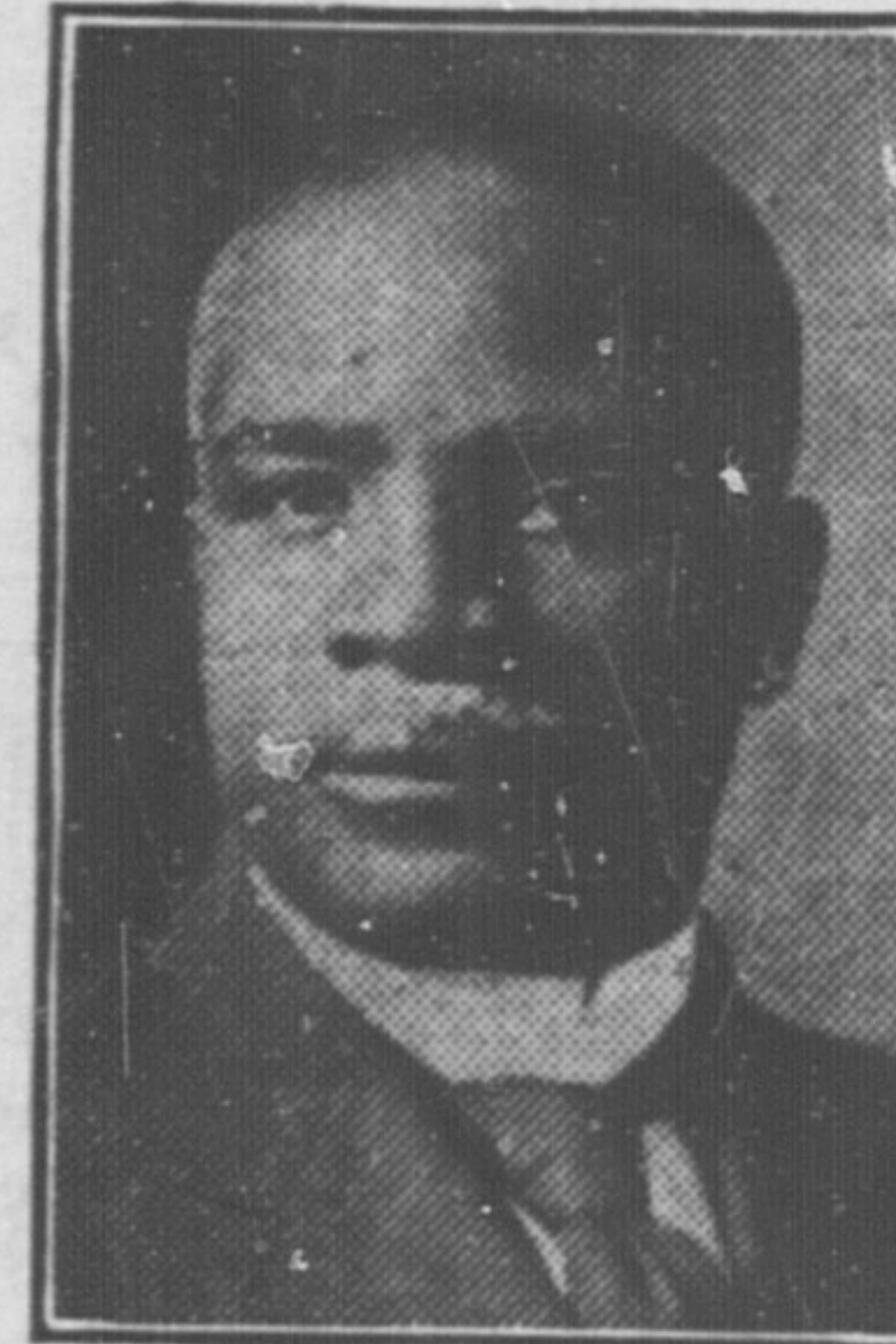
Prof. Kelly Miller, Howard University Washington, D. C.