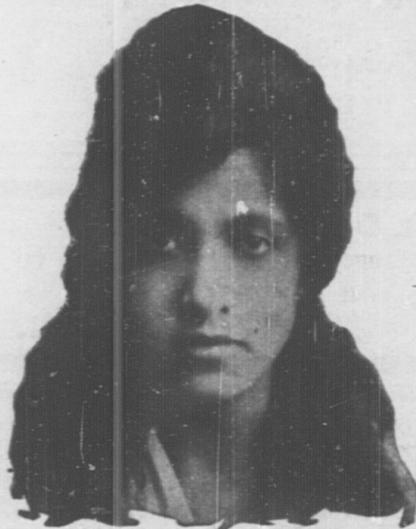
A Kashmir Girl