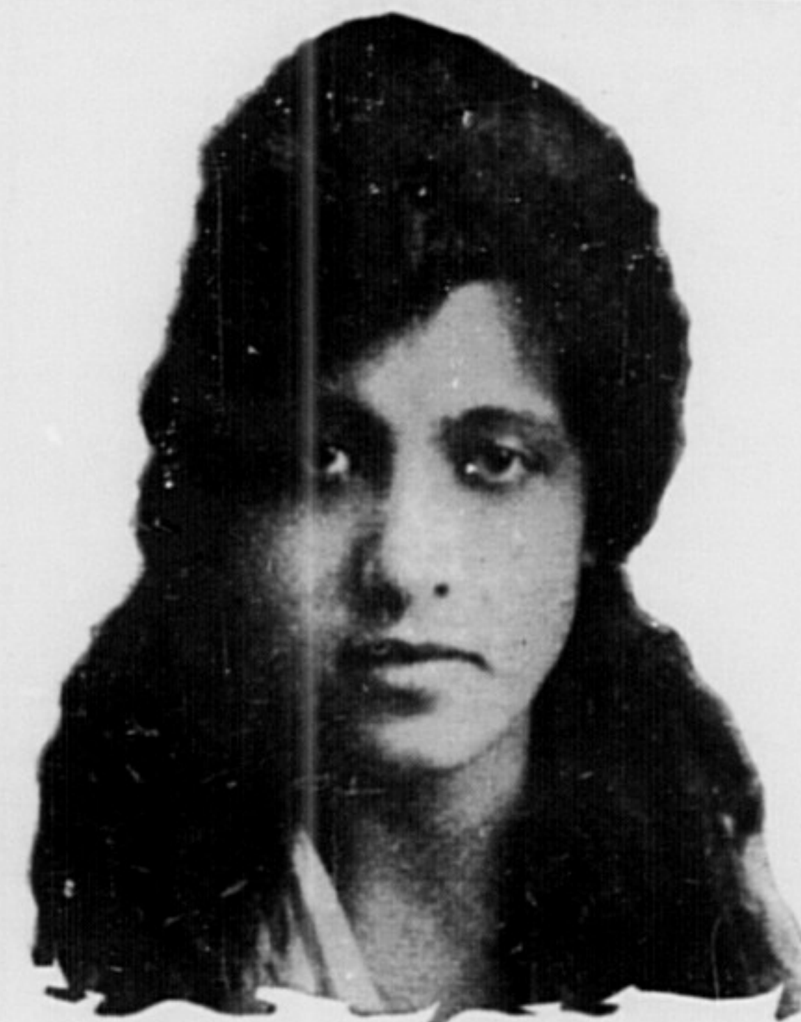
A Kashmir Girl