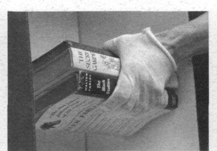
The incorrect way to store books, on their text block.