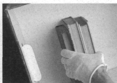
How to properly store books, spine down, in a box.