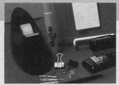
A grouping of equipment not suitable for archival-type collections stickers, pens, plastic envelopes, stapler, highlighter, and metal clips.

I want copies of all my papers and photographs before I