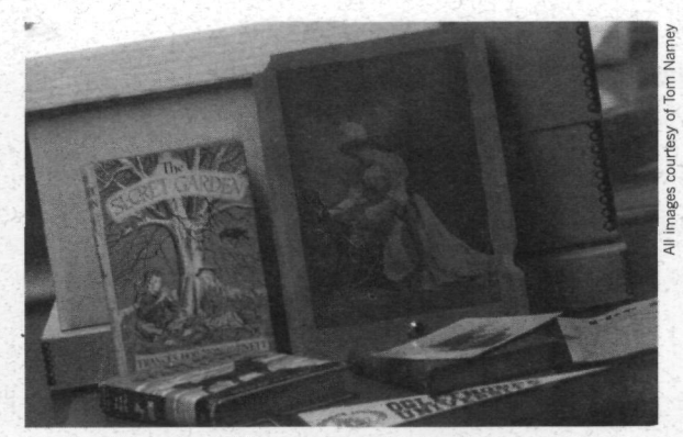
Typical items found in a personal collection.

You should have your items appraised before you