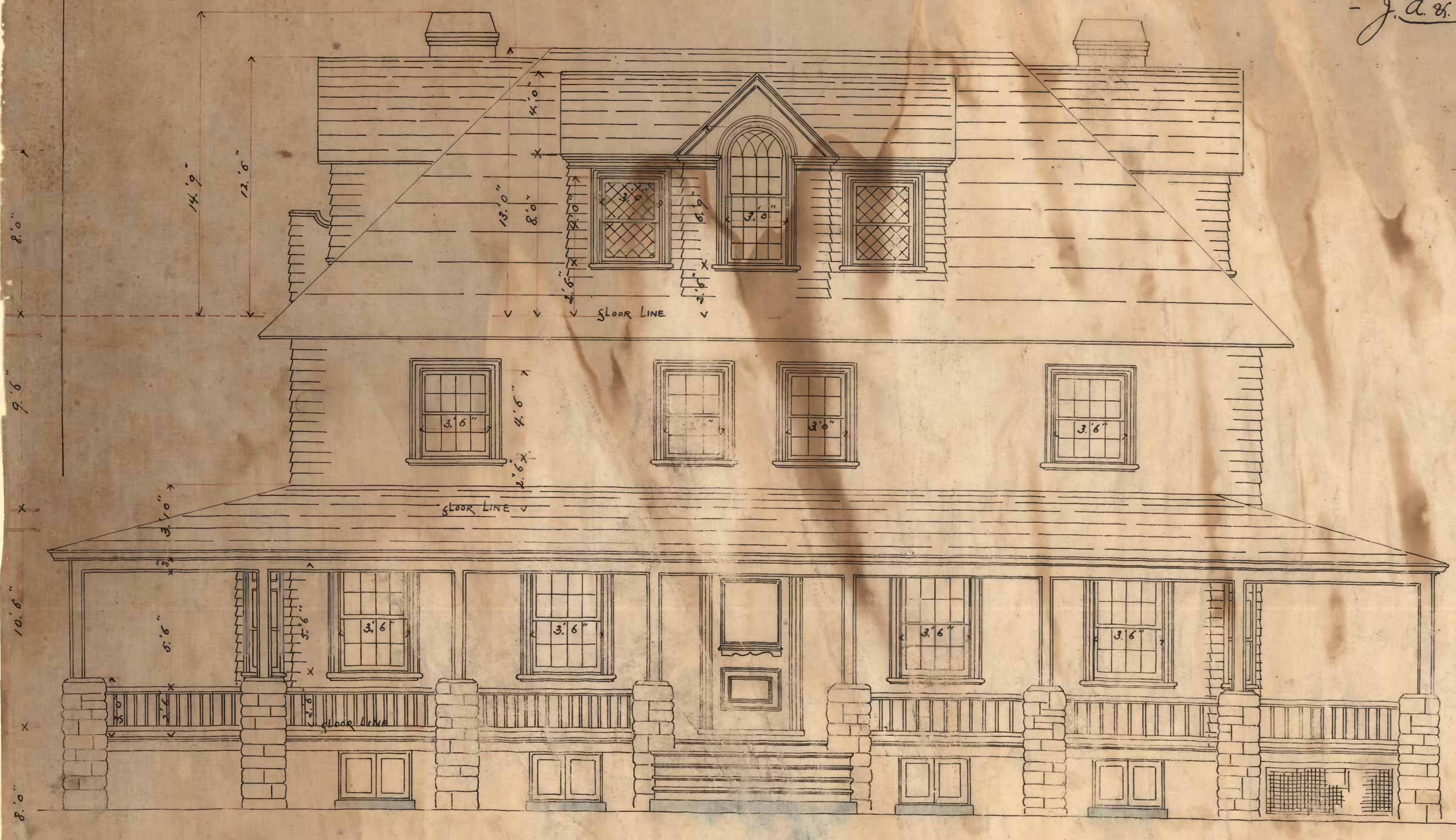
- WEST ELEVATION -