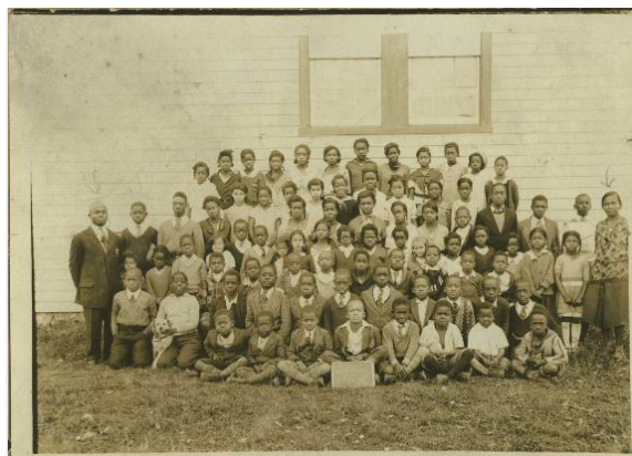
Bel Air Colored School – 1932 (Original 5"x7", shown reduced)

the chalk board that read "Bel Air School 1932". Thus the location (Bel Air), the date (1932) and the picture description (Bel Air Colored School-1932) could now be entered into the database. This picture is now identified as Photo 00003.