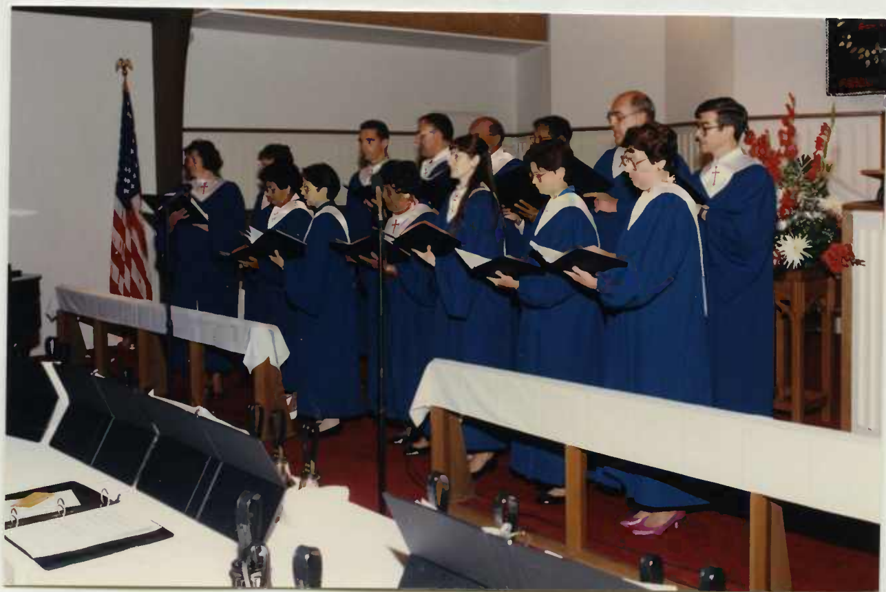
THE SANCTUARY CHOIR