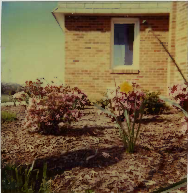
The Hallman Garden