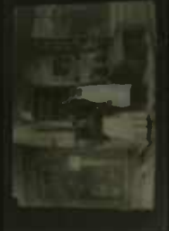
→ 7A KODAK SAFETY FILM 5063