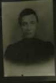
→ 1A KODAK SAFETY FILM 5063