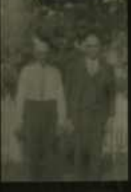
→ 12A KODAK SAFETY FILM 5063