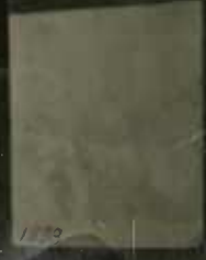
→ 5A KODAK SAFETY FILM 5063