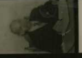
→ 23 KODAK SAFETY FILM 5063