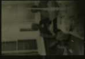
→ 23A KODAK SAFETY FILM 5063