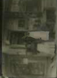
→ 9A KODAK SAFETY FILM 5063