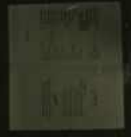
→ 14A KODAK SAFETY FILM 5063