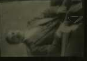
→ 22A KODAK SAFETY FILM 5063