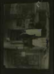
→ 8A KODAK SAFETY FILM 5063