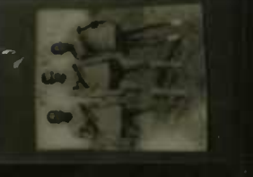
→ 21A KODAK SAFETY FILM 5063