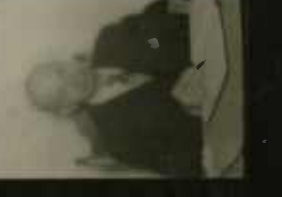
→ 22A KODAK SAFETY FILM 5063