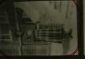
→ 24A KODAK SAFETY FILM 5063