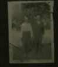
→ 11A KODAK SAFETY FILM 5063