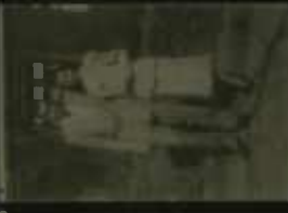
→ 25 KODAK SAFETY FILM 5063