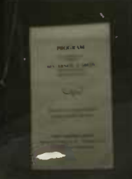
→ 13A KODAK SAFETY FILM 5063