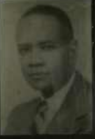
→ 16A KODAK SAFETY FILM 5063