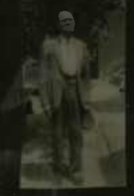
→ 10 KODAK SAFETY FILM 5063