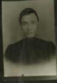
→ 0 KODAK SAFETY FILM 5063