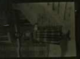
→ 4A KODAK SAFETY FILM 5063