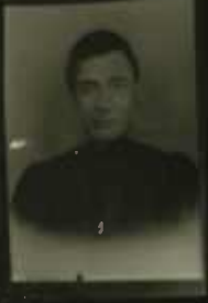
→ 9A KODAK SAFETY FILM 5063