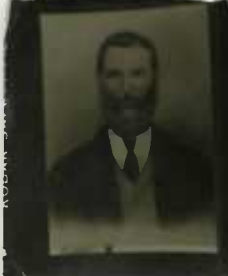
→ 3A KODAK SAFETY FILM 5063