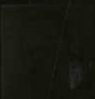
→ 15A KODAK SAFETY FILM 5063