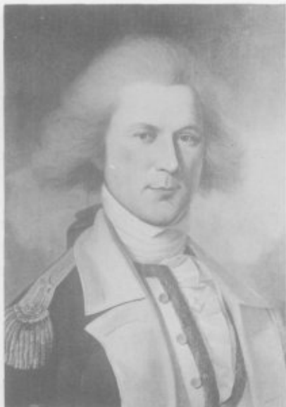
Otho Holland Williams. 1749-1794. Painting by Charles Willson Peale.

Lee of Virginia. 34 On the same tack, he wrote to Pennsylvanian Robert Morris, citing his "small share in the revolution in the Government of my native Country." 35 Later, Williams wrote directly to Washington. Pointing out his qualifications, he rested his "hopes of your Excellencys approbation entirely upon my experience and knowedge of the business." 36 Such persistence was not to be denied. Williams received the post.