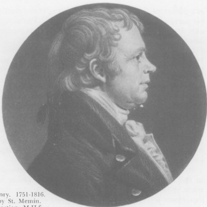
James McHenry. 1751-1816

who had caught the disease against those who bitterly decried the demoralization of rampant speculation.