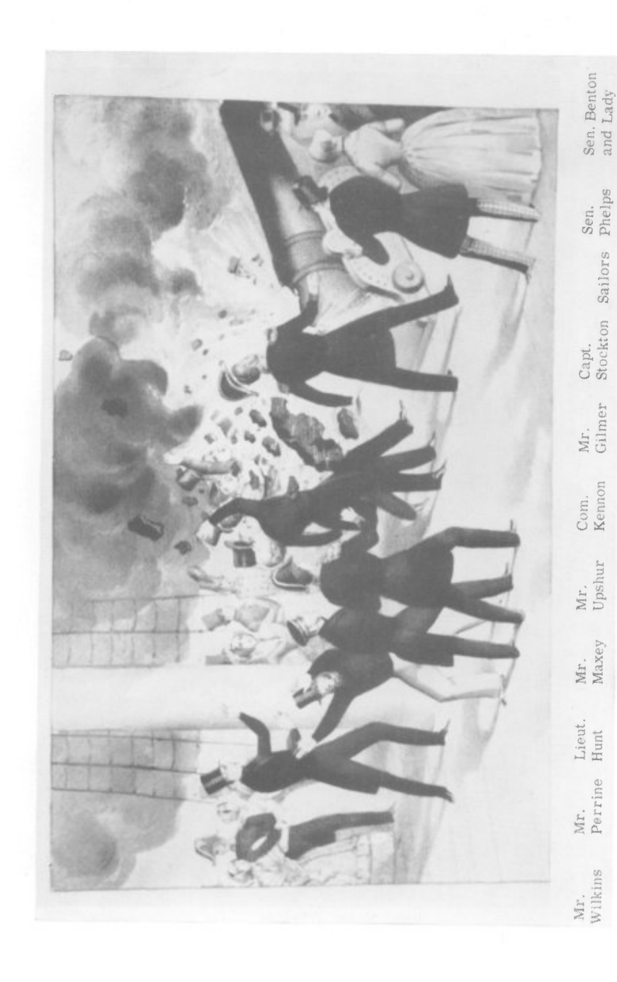
Currier and Ives print, Courtesy U.S. Naval Academy Museum.