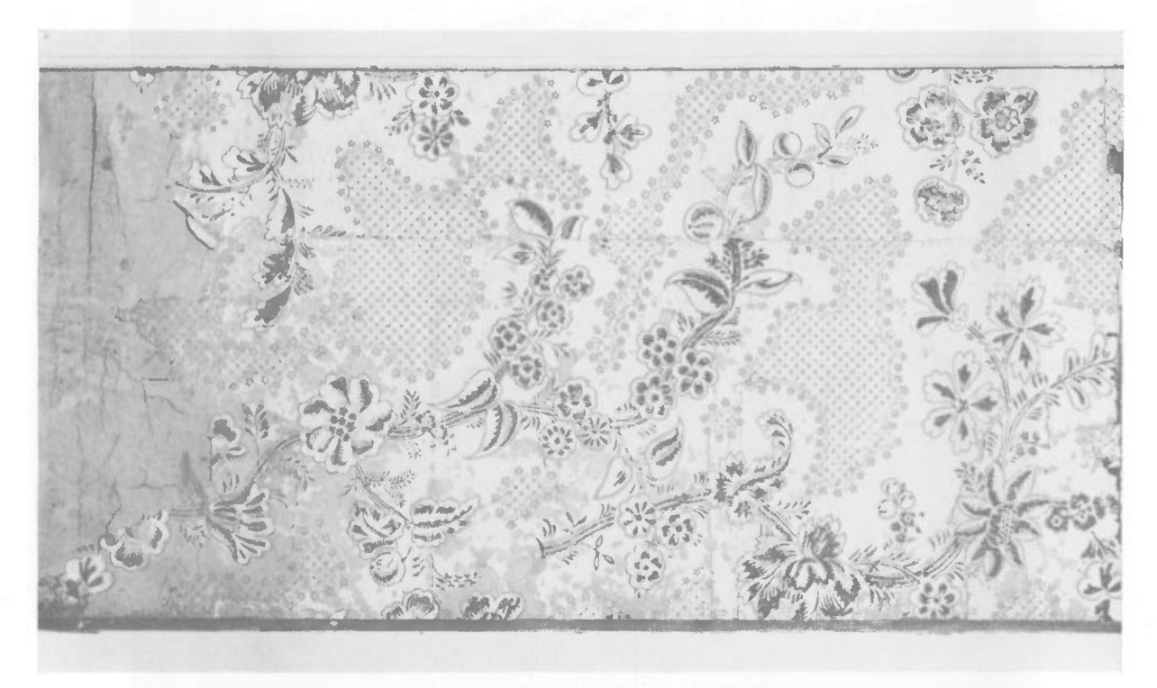
The original wallpaper decoration, as it appeared after recent removal of a section of paneling in one of the principal bedrooms. For the first time in more than two hundred years the entire colorful design, featuring tulip flowers, can be seen.