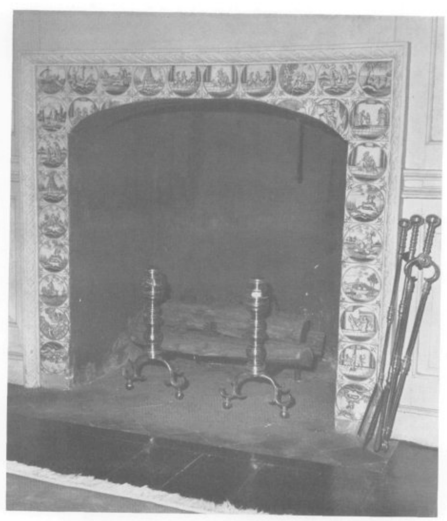
Holland tiles, original in the decoration of a bedroom fireplace.