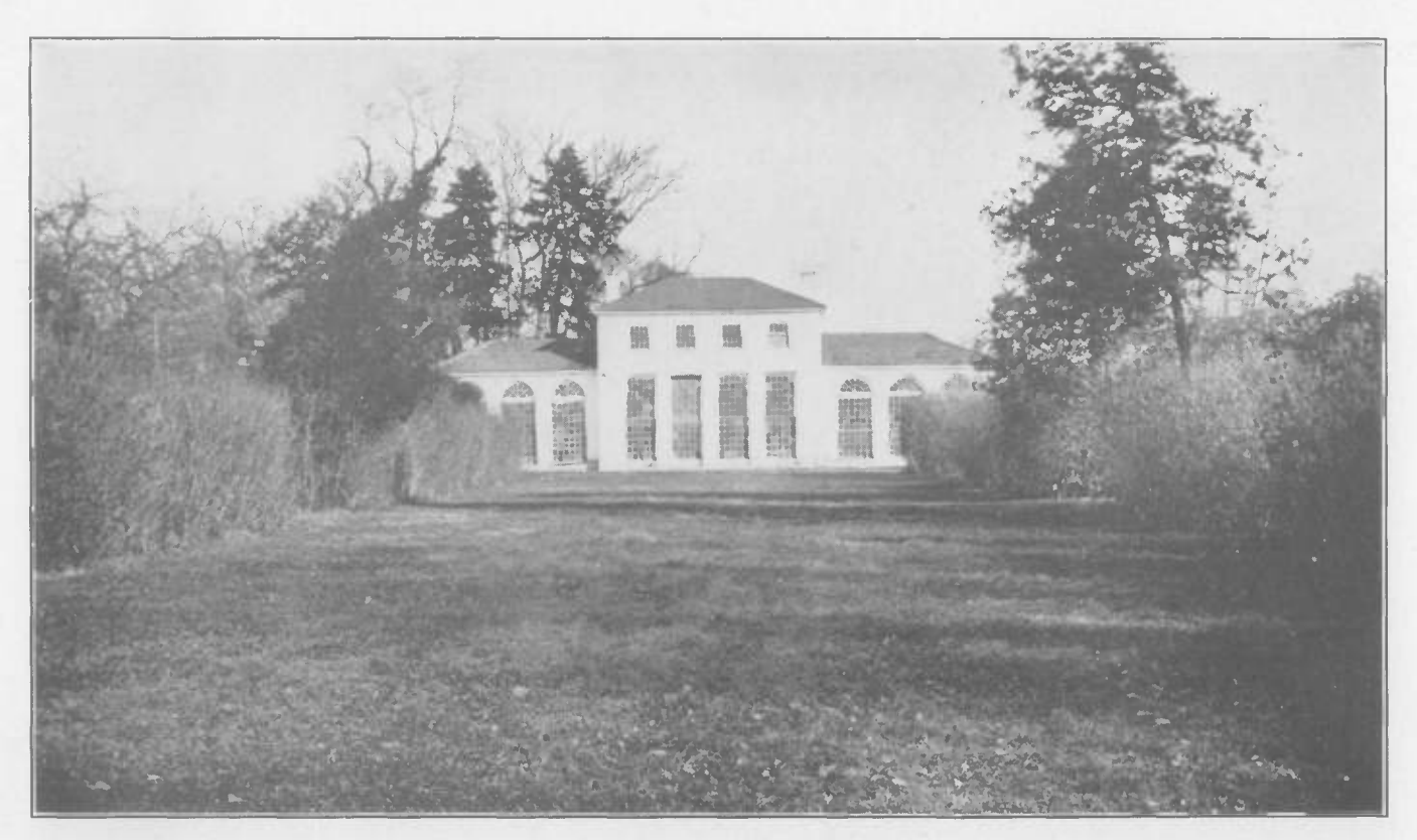
BACK LAWN AND GREENHOUSES