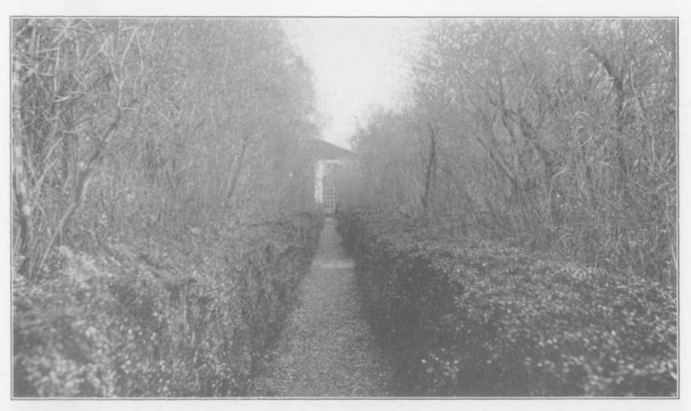
BOX AND GRAVEL WALK