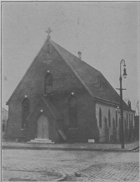
SHARON BAPTIST CHURCH 1890 A. D.