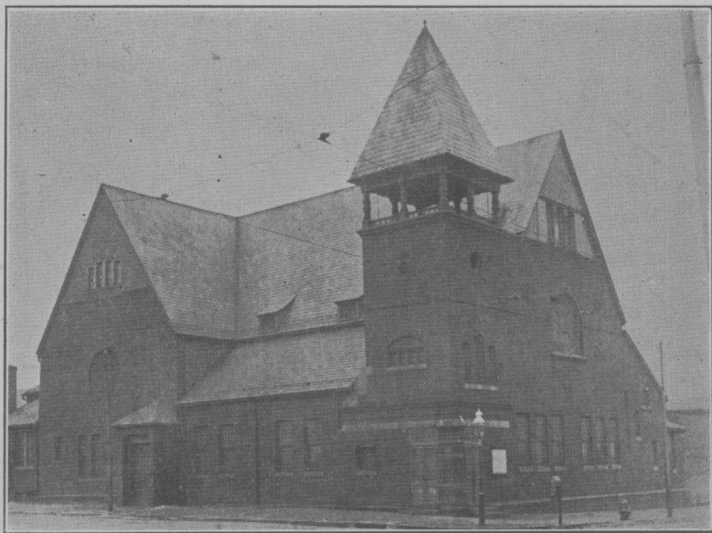
SHARON BAPTIST CHURCH 1900 A. D.