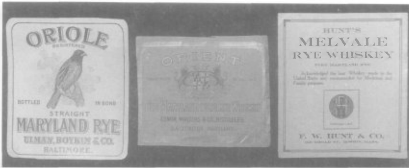
Printers' specimen labels from the author's collection.

to reduce workforce drunkenness, sought a liquor ban near their factories. By 1885, following passage of a county-option law, the sale of liquor was banned in Anne Arundel, Calvert, Caroline, Cecil, Dorchester, Harford, Howard, Kent, Montgomery, and Talbot counties, and in most of Somerset and Queen Anne's. The wets' losses mounted: in 1916 the dries obtained a general, not local, statute, one requiring the wet/dry question to go on the ballot (the dries promptly picked up Carroll, Frederick, and Washington counties). 33 By 1918, 84 percent of Maryland's land area was statutorily dry—the cities (including Annapolis) turning into oases of a sort. Six residential districts in north and west Baltimore itself had opted for an end to saloons and liquor retailing. 34 Throughout, the American and most other Baltimore dailies accepted liquor advertising. The Sun , on the other hand, spurned such income until about 1905. The contrast with its wet or anti-Prohibition vehemence in the 1920s and early 1930s is startling.