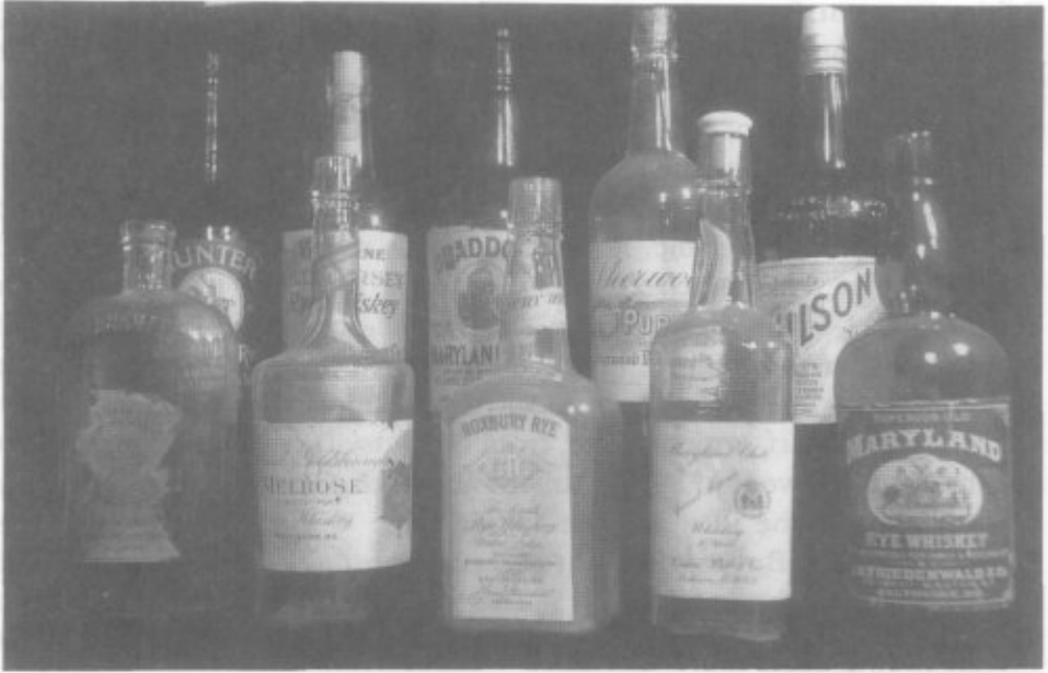
Ten leading turn-of-the-century brands: (rear) Hunter, Old Horsey, Braddock, Sherwood, Wilson, (front) Monticello, Melrose, Roxbury, Maryland Club, Friedenwald's Maryland.