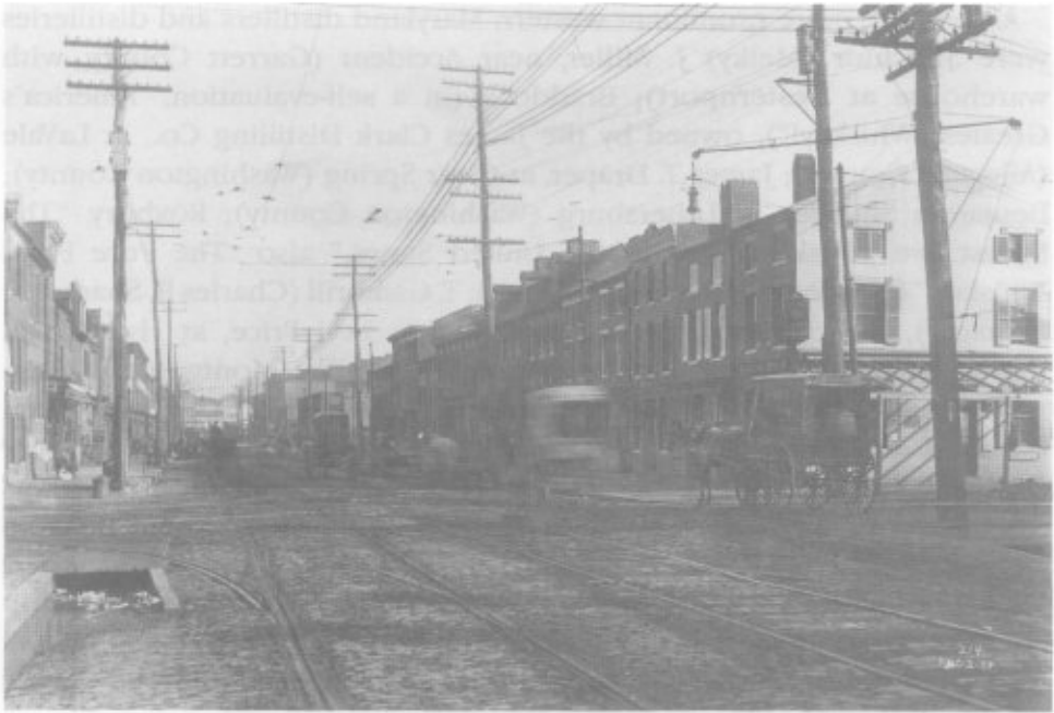
At Wolfe and Aliceanna streets, about 1910, a Phillip Lobe Co. vehicle speeds barrels of Ram's Horn whiskey to saloons.

building a facsimile English castle to please his twenty-two-year-old third wife; he died within five years.