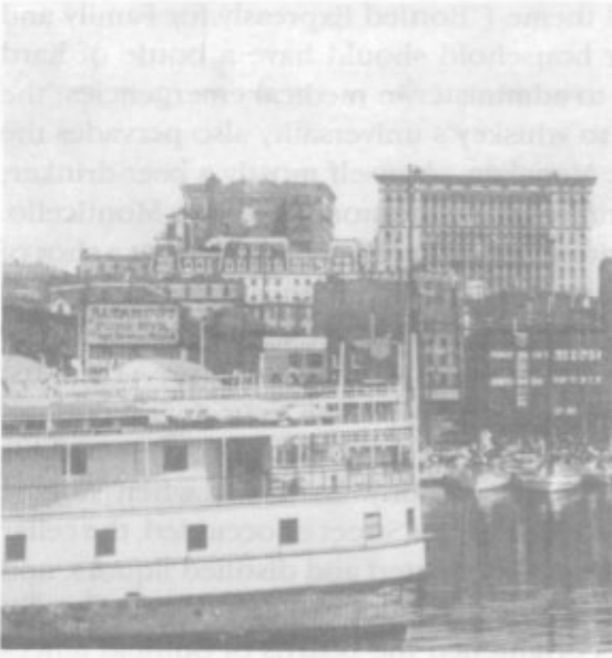
Beckoning to the traveler at the pre-1904 Basin: Altamont Pure Rye. This sign was painted on the rear wall of N.H. Matthews Co.'s offices. From a postcard in the author's collection.

Roxbury from western Maryland; Calvert, Melvale, Monticello, Mount Vernon, Orient, Stewart, and Sherwood from Baltimore). In addition, a roster of malt whiskies (made from different ingredients) included Braddock, among ten nationally. Wholesale quotations ranged from forty-five cents a gallon (Roxbury, made that same spring) to $1.45 (Melvale 1896, Stewart 1897), with one striking exception: Sherwood distilled in the spring of 1892 sold at $3.15.